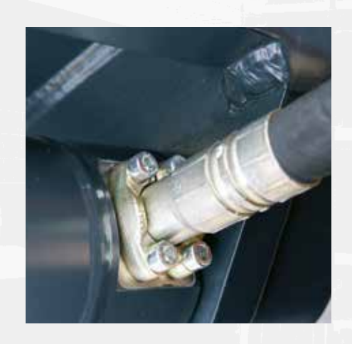
A fully variable hydraulic system enables faster, more precise manoeuvres.

Electronically controlled drive train offers >25 % peak torque and seamless gearshift.