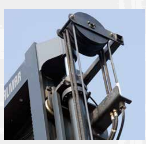
The DCF80-100 has considerably fewer hoses over the mast compared to conventional machines (2 hydraulic hoses and 1 electrical cable). This provides high functional reliability.