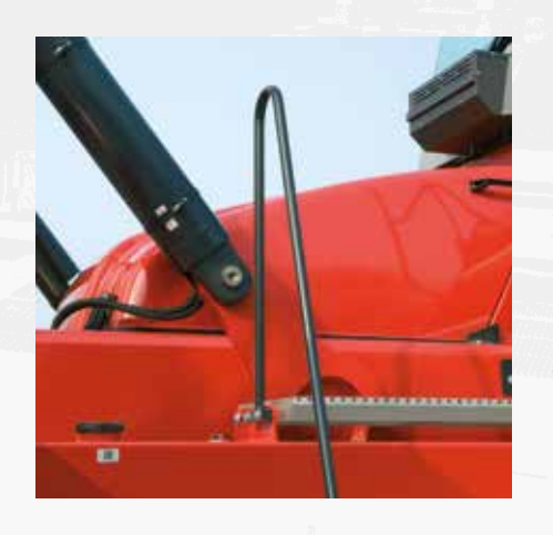
The DCF80-100 is easily recognisable by its elegant, sleekly rounded bonnet.